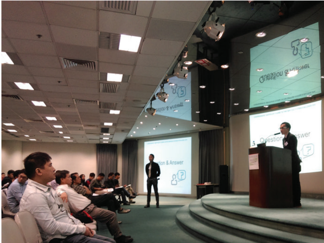
The audiences are actively asking for information about FirePro.

A ll in all, the event is a success one as the message of condensed aerosol is delivered to many people who are not familiar with this extinguishing technology. We also receive a number of feedbacks and enquiries from the audiences about condensed aerosol in the Q&A session. On the whole, people show positive attitude towards condensed aerosol after the speech.