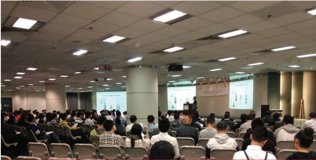
About 200 audiences are present to the speech

T hanks to the phasing out of some existing fire extinguishing agents in Hong Kong, people are much aware of the importance of an environment friendly agent. Thus, the prime aim of the speech is to deliver the below key points to the audiences: