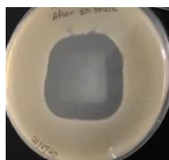
Figure 1: Aeris Active surface with 50 touches

Results demonstrating Aeris Active bactericidal effectiveness against S. aureus for 50, 100 and 200 touches.