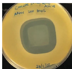
Figure 3: Aeris Active surface with 200 touches