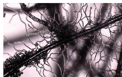
Untreated (Filter Fibres)